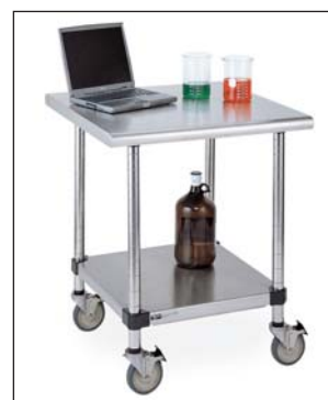
LTSM30IS with casters