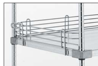
4" (101mm) Ledges

*Actual ledge length is approximately 1" (25mm) shorter than nominal shelf length/width.