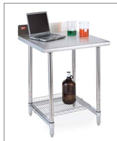
LTS30US with accessory stainless wire shelf