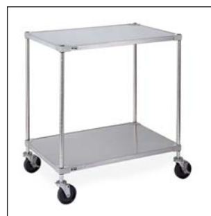
LC2S1824 (casters ordered separately)

All Metro Catalog Sheets are available on our website: www.metro.com