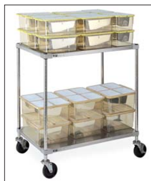
LC2S2436 with autoclave casters