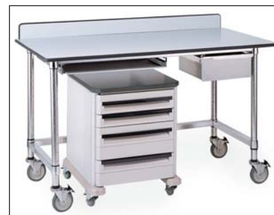
LTSM60UPG with accessories, casters, backsplash accessory, and Starsys™ cart

Stainless Lab Tables are load rated at 50 lbs. per sq. foot (.024kg per sq. cm) up to a maximum of 600 lbs. (273kg) assuming evenly distributed load and caster specification meets requirement.