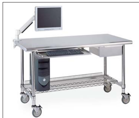
LTSM60UIS with accessories and casters