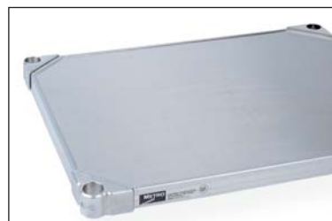
All stainless solid shelf with stainless corners