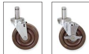
5MHTP and 5MHTPB (Hi-temp phenolic autoclave casters)