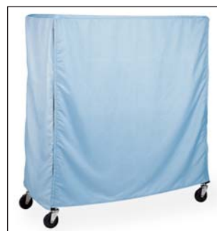
LC5S2460 with autoclave cart cover (casters ordered separately)