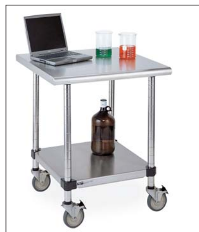
LTSM30IS with casters

Epoxy resin: Epoxy resins, silica, organic fillers, and inert hardeners are cast in forms and cured to a uniform mixture throughout.