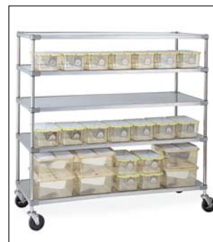
LC5S2460 (casters ordered separately)

When stainless solid shelving, as part of a mobile shelving unit, is used in an autoclave, the following Metro product guidelines are recommended to ensure optimal product performance and longevity: Stainless, swedged posts with aluminum post caps must be utilized [part numbers 33/54/63UPS-SW] Aluminum split sleeves [part number 9986S] with stainless rings should be used to mount solid stainless shelves. Select either hi-temp phenolic casters or hi-temp nylon casters for application. These casters are designed specifically for autoclave environments. Bumpers should not be used as they are not designed to withstand autoclave temperature ranges