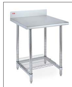
LTS30US with accessory wire shelf

Stainless Lab Tables are load rated at 50 lbs. per sq. foot (.024kg per sq. cm) up to a maximum of 600 lbs. (273kg) assuming evenly distributed load and caster specification meets requirement.