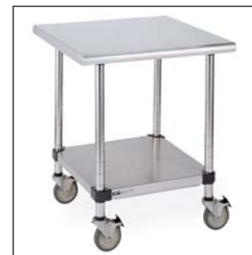
LTSM30IS with casters (ordered separately)

Stainless Lab Tables are load rated at 50 lbs. per sq. foot (.024kg per sq. cm) up to a maximum of 600 lbs. (273kg) assuming evenly distributed load and caster specification meets requirement.