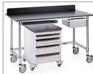
LTSM60UPB with accessories, casters, backsplash accessory, and Starsys™ cart

Stainless Lab Tables are load rated at 50 lbs. per sq. foot (.024kg per sq. cm) up to a maximum of 600 lbs. (273kg) assuming evenly distributed load and caster specification meets requirement.