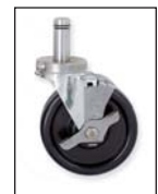
5MHTP & 5MHTPB