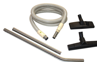
MV-1CR Tools and Accessories - Optional