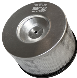
ULPA filter for MV-1CR (HH-CC) - individually laser tested