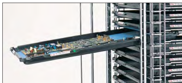
SmartTray™ engages with wire cart design to provide optimum ergonomic access.