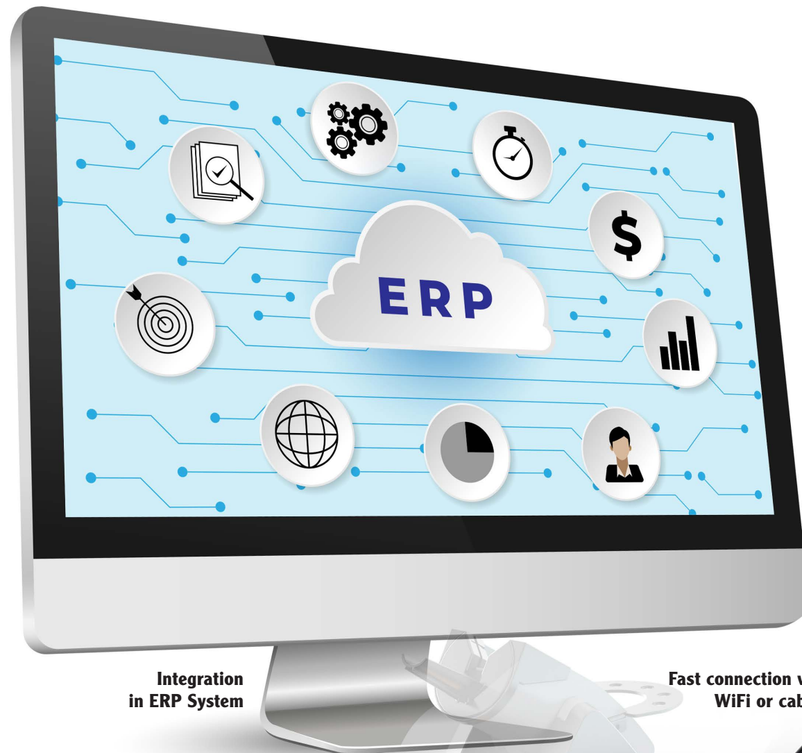
Integration in ERP System