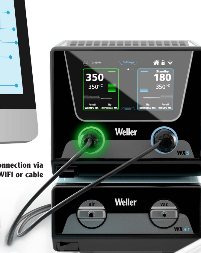
Fast connection via WiFi or cable