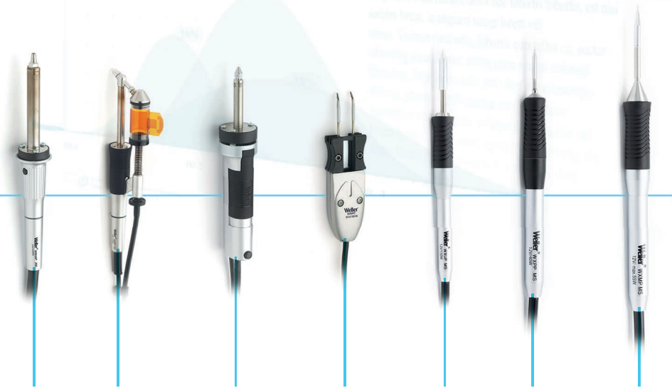
WXHAP Hot Air Iron WXDP Desoldering Iron WXDV Desoldering Iron WXMT Tweezers WXP65 Soldering Iron WXMPSMS Pico and Micro Soldering Iron WXUPSMS Heavy Duty Soldering iron

Once invested in the WXsmart platform, the system can be expanded at will. Many tools that you already use can be easily connected. Thus we protect your investment and you are prepared for the future. With only one station.